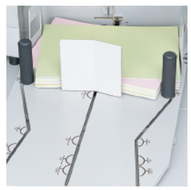
The criss-cross stacking feature allows easy set separation.